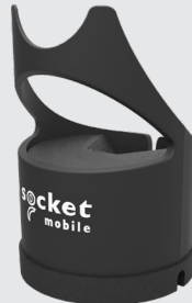
Charging Dock SKU# AC4133-1871