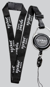
Lanyard - Black AC4100-1692