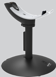
Charging Stand SKU# AC4159-1956