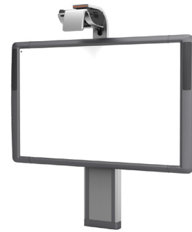
ActivBoard 300 Pro Adjustable with EST-P1 projector