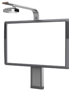
ActivBoard 300 Pro Adjustable with PRM-30a or PRM-35 projector