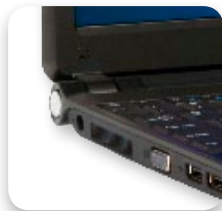
X class c family Connectivity