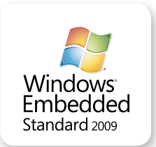
Microsoft Windows Embedded Standard 2009