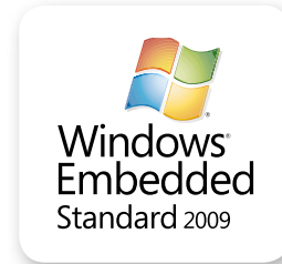
Microsoft Windows Embedded Standard 2009