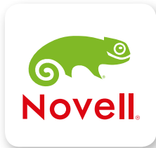
Wyse Enhanced SUSE Linux