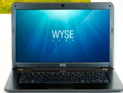
Wyse X class m family