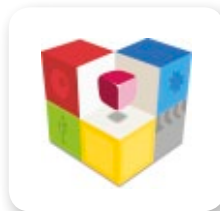
User Experience Optimization