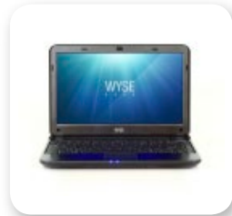
Wyse X class Specifications c family