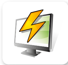
User Experience Acceleration