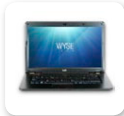
Wyse X class Specifications m family