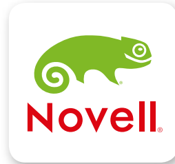
Wyse Enhanced SUSE Linux