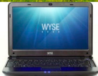
Wyse X class c family