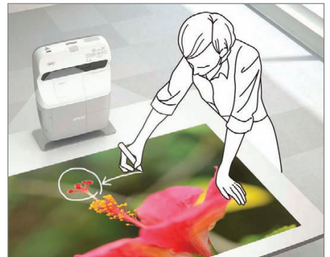
Project onto any horizontal surface such as a tabletop