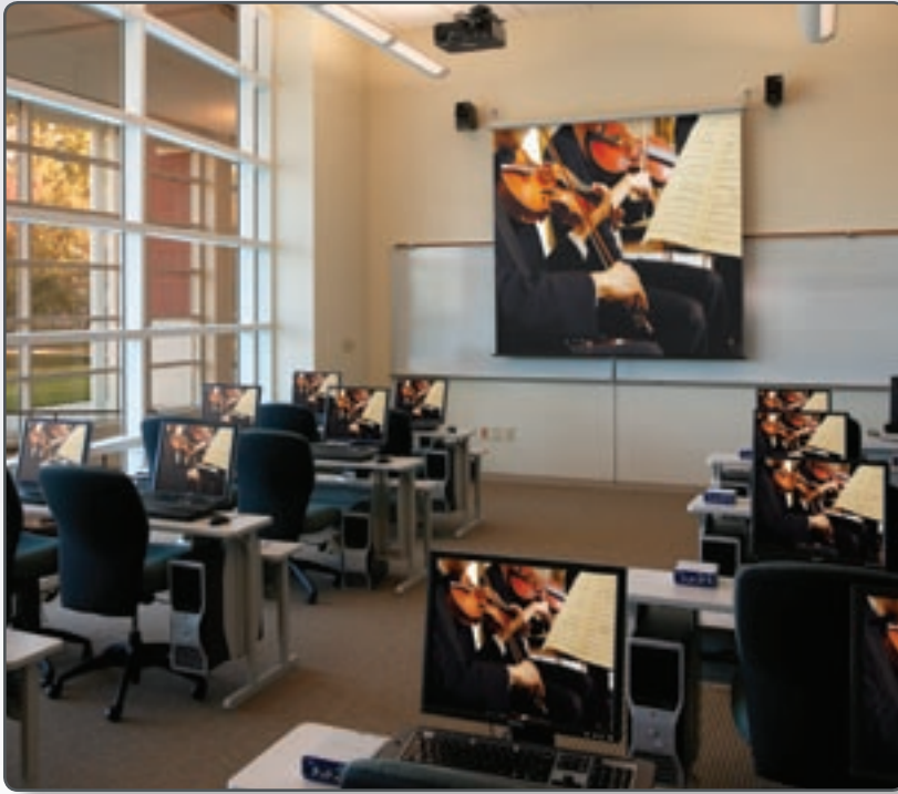
DePauw University, Greencastle, IN.