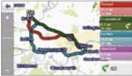
Choice of Routes