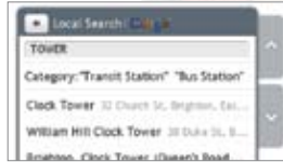
Google Local Search