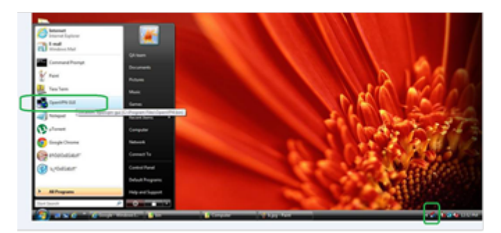
Figure 6. The OpenVPN icon displays in the Windows taskbar.

1. Launch the OpenVPN application with administrator privileges.