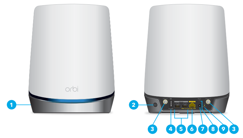
Figure 1. Orbi modem router model front and rear view