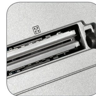
▶ Easy docking