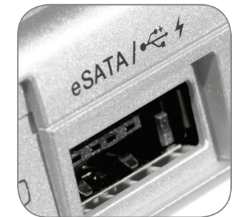
▶ USB Sleep-and-Charge/ eSATA port