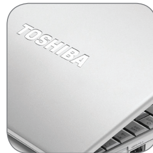
▶ Stylish design