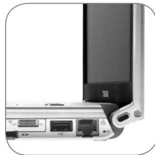
▶ Thin and light laptop